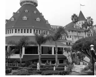
Hotel del Coronado

Gate Bridge, sits the landmark Fairmont Hotel. The Fairmont (just before it opened for business) survived the famous earthquake and fire of 1906 unharmed. After the great fire, Julia Morgan, the first woman graduate of the prestigious Ecole des Beaux Arts in Paris (who would later be known as one of the preeminent female architects) was hired to oversee any necessary repair, redecoration and restoration. The Fairmont recently completed an $85 million restoration. To learn more about our San Francisco reception location, visit www.fairmont.com . (1/8/04, 5:30–7:30 p.m.)