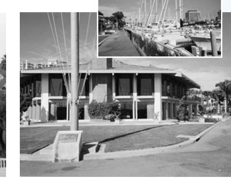
California Yacht Club (with view from Club pictured above)

The Yale Club is located in the heart of Manhattan on Vanderbilt Avenue, directly across the street from Grand Central Terminal. Convenient for those who work in the City and for those who would like to visit the Big Apple, the Yale Club features a wonderful blend of old New England charm and exciting big city life. To learn more about our New York City reception location, visit www.yaleclubnyc.org. (2/5/04, 5:30-7:30 p.m.)