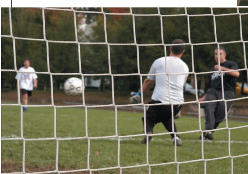
Former AMC soccer players give it their all during the alumni game.