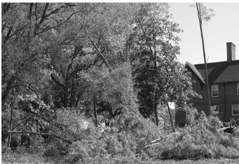
Hurricane Irene visited the campus on Sunday, August 28, taking down branches and several trees. In advance of the storm, the College had rescheduled Sunday's Moving-in Day activities and orientation for new students to Monday. Classes began Wednesday on schedule.