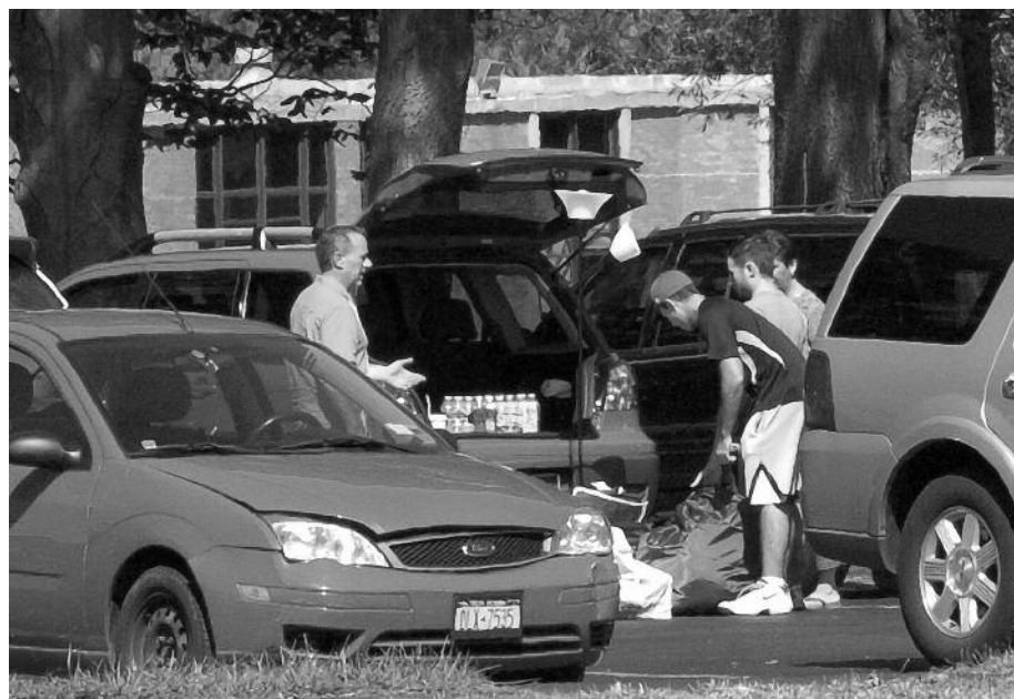
Hurricane Irene visited the campus on Sunday, August 28, taking down branches and several trees. In advance of the storm, the College had rescheduled Sunday's Moving-in Day activities and orientation for new students to Monday. Classes began Wednesday on schedule.