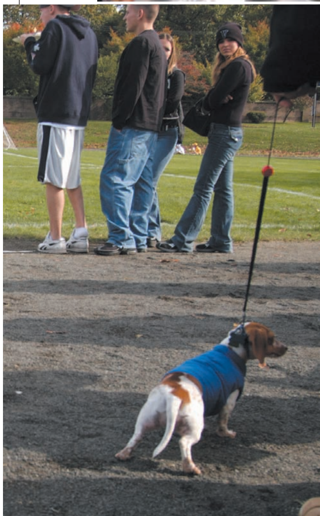
Everyone had Falcon spirit at Fall Fest.