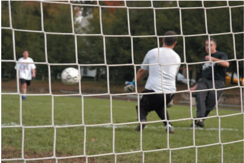
Former AMC soccer players give it their all during the alumni game.