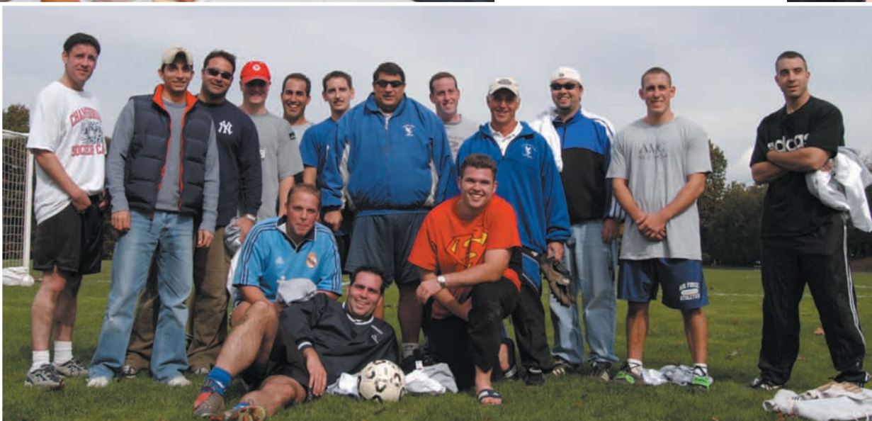
"The old guys still got it." More than a dozen former AMC soccer players participated in the alumni game.