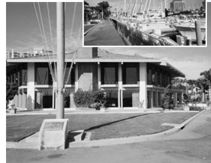
California Yacht Club (with view from Club pictured above)