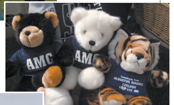
The bookstore featured many items at the alumni tent.