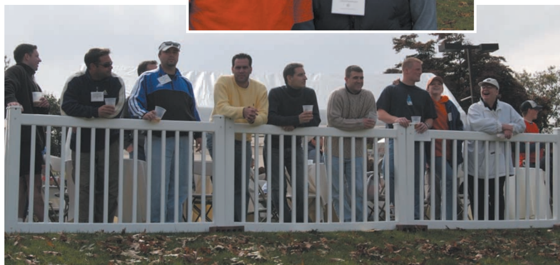
Soccer alumni enjoy a front row spot at the hospitality tent.