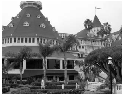
Hotel del Coronado

Atop Nob Hill, with an unbelievable view of San Francisco Bay and the Golden Gate Bridge, sits the landmark Fairmont Hotel. The Fairmont (just before it opened for business) survived the famous earthquake and fire of 1906—unharmed. After the great fire, Julia Morgan, the first woman graduate of the prestigious Ecole des Beaux Arts in Paris (who would later be known as one of the preeminent female architects) was hired to oversee any necessary repair, redecoration and restoration. The Fairmont recently completed an $85 million restoration. To learn more about our San Francisco reception location, visit www.fairmont.com . (1/8/04, 5:30–7:30 p.m.)