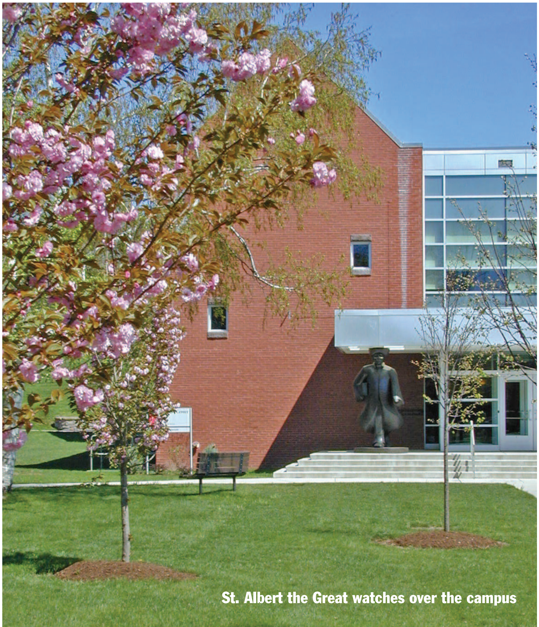
St. Albert the Great watches over the campus