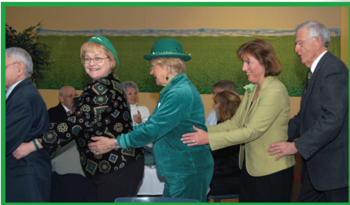
To a rousing rendition of McNamara's Band , guests formed a conga line and danced throughout the dining hall.