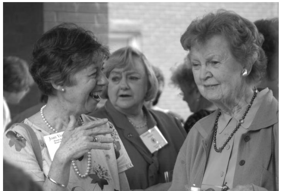
Reunion....old photos, good friends and fond memories....